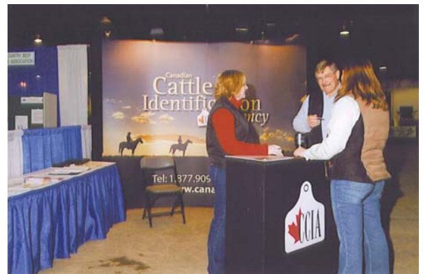
CCIA STAFF TALK TO PRODUCERS ACROSS CANADA